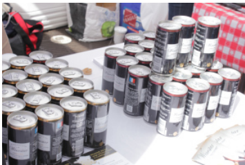
( https://diaryofthefrizzyhairedfreak.files.wordpress.com/2015/10/055.jpg )

Wine in a can. Man, the French think of everything.