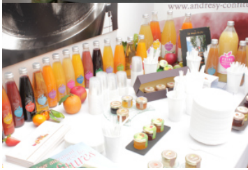
( https://diaryofthefrizzyhairedfreak.files.wordpress.com/2015/10/060.jpg )

Here are some other glorious wonders uncovered: