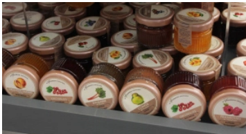
( https://diaryofthefrizzyhairedfreak.files.wordpress.com/2015/10/058.jpg )