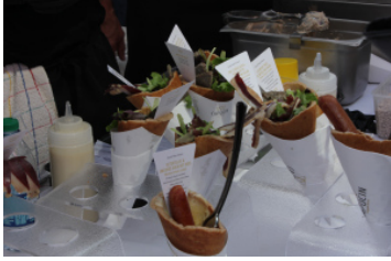
( https://diaryofthefrizzyhairedfreak.files.wordpress.com/2015/10/027.jpg )

Here are some other glorious wonders uncovered: