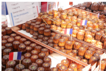
( https://diaryofthefrizzyhairedfreak.files.wordpress.com/2015/10/064.jpg )

I scooped up 2 chocolate covered macaron lollipops, ( http://www.maison-kayser.com/fr/ ( http://www.maison-kayser.com/fr/ )) (one Rasberry Lychee flavored and one Passion Fruit flavored). 3 of the most delicious caneles ( http://www.seriousseats.com/2014/05/where-to-get-best-canele-in-new-york-city.html ( http://www.seriousseats.com/2014/05/where-to-get-best-canele-in-new-york-city.html )) in caramel, vanilla and pistachio (Pistachio stole my heart).