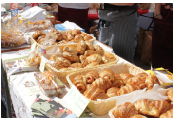
( https://diaryofthefrizzyhairedfreak.files.wordpress.com/2015/10/033.jpg )