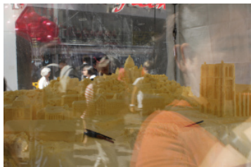
( https://diaryofthefrizzyhairedfreak.files.wordpress.com/2015/10/024.jpg )

How about this guy carving out the city of Paris out of President butter?